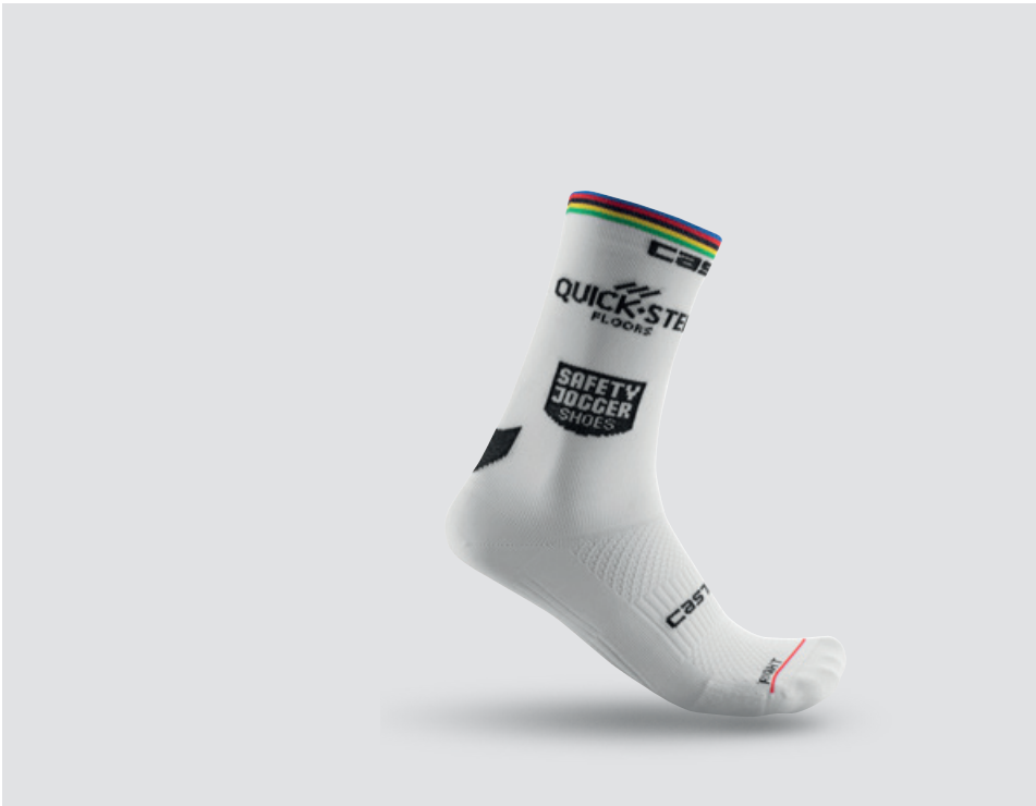
001 WORLD CHAMPION