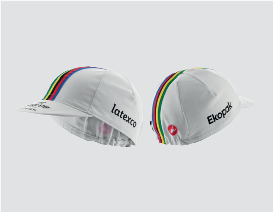
001 WORLD CHAMPION