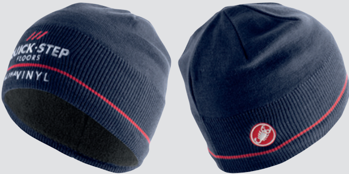
424 BELGIAN BLUE