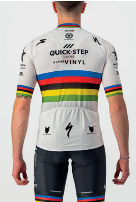
001 WORLD CHAMPION