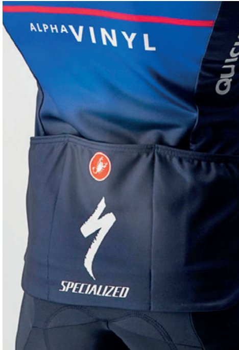
424 BELGIAN BLUE