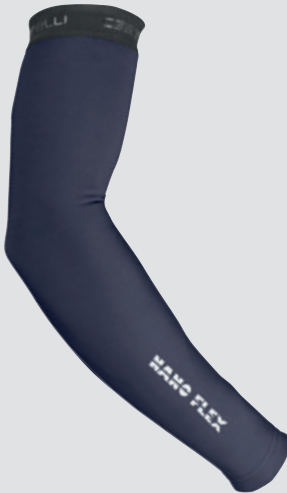
424 BELGIAN BLUE