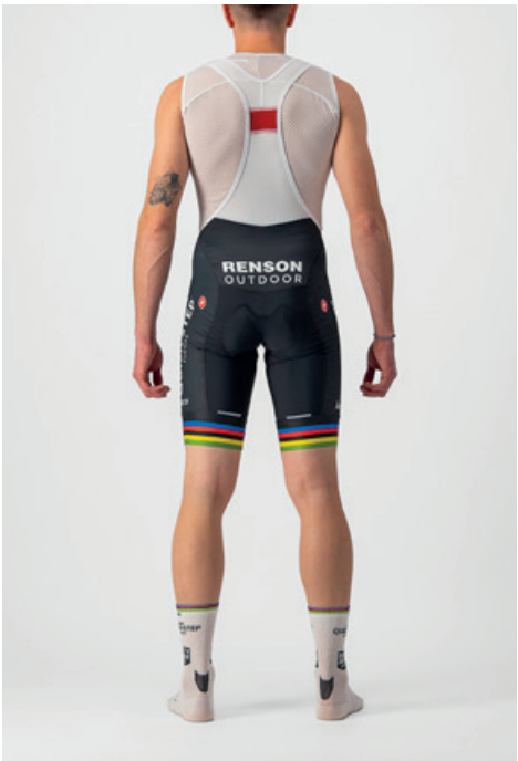
001 WORLD CHAMPION