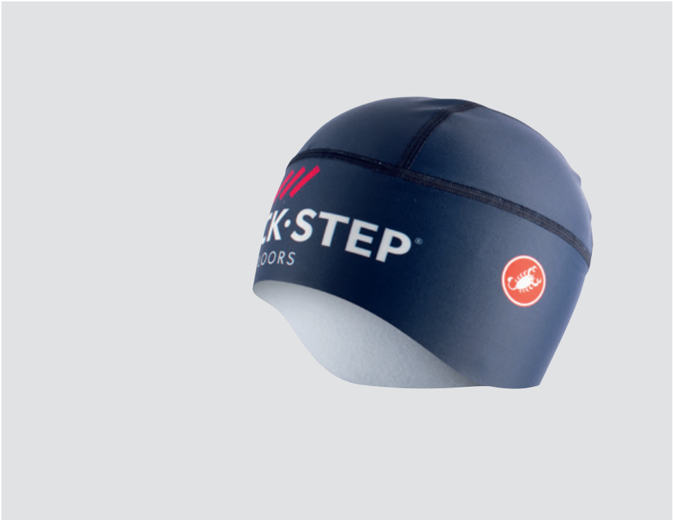
424 BELGIAN BLUE