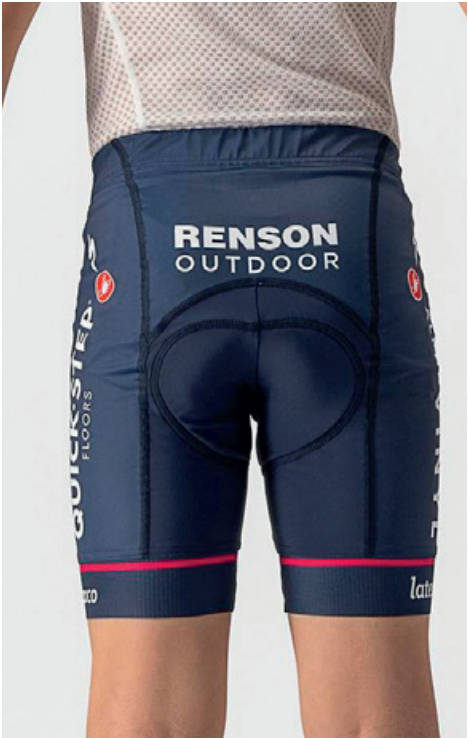
424 BELGIAN BLUE