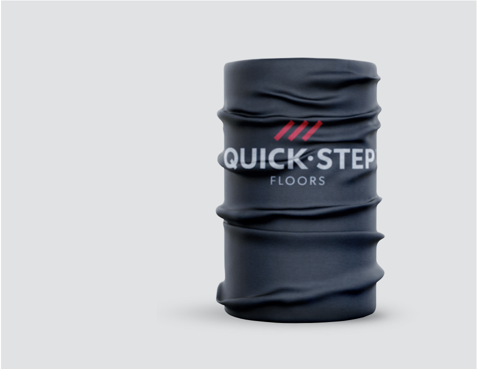
424 BELGIAN BLUE