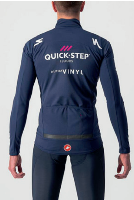
424 BELGIAN BLUE