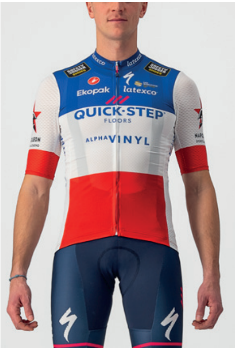
850 FRENCH CHAMPION