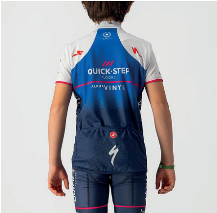
424 BELGIAN BLUE