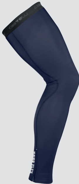
424 BELGIAN BLUE