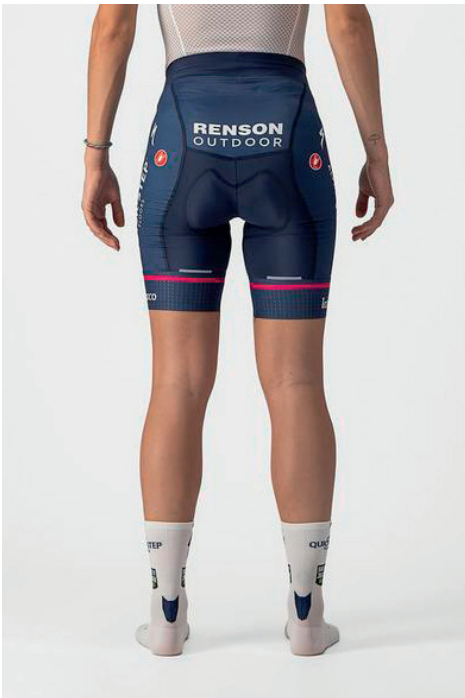
424 BELGIAN BLUE/WHITE