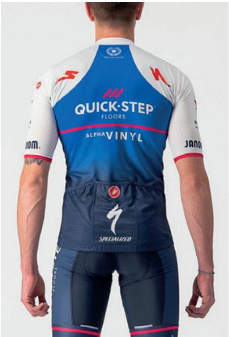
424 BELGIAN BLUE/WHITE