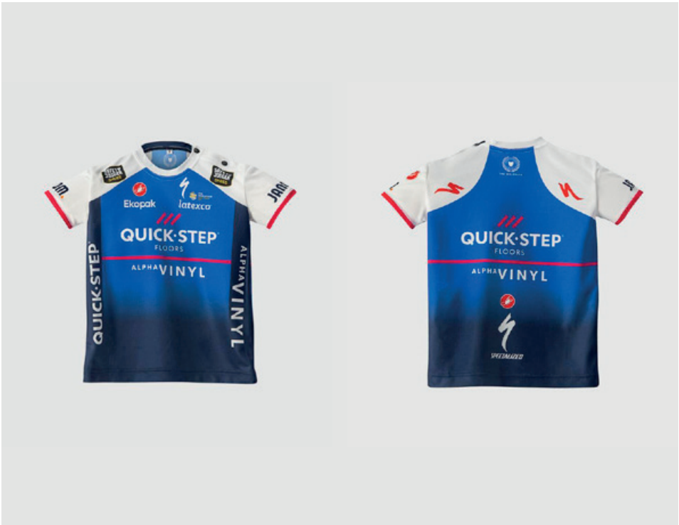
424 BELGIAN BLUE/WHITE