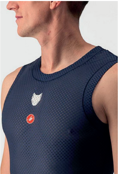
424 BELGIAN BLUE

The pro cyclists we work with know the importance of the right base layer for the conditions. The Pro Mesh is made for the widest range of conditions and is designed to keep you dry in cool to mild temperatures. We'll even put it under a Flanders Warm base layer in the coldest conditions. We've given it a graphic print so you can show off that you have something special when you open your jersey zip.