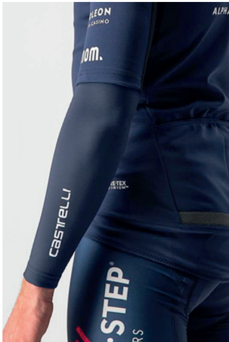
424 BELGIAN BLUE