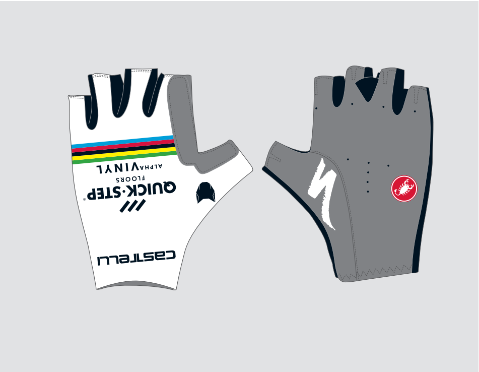
001 WORLD CHAMPION