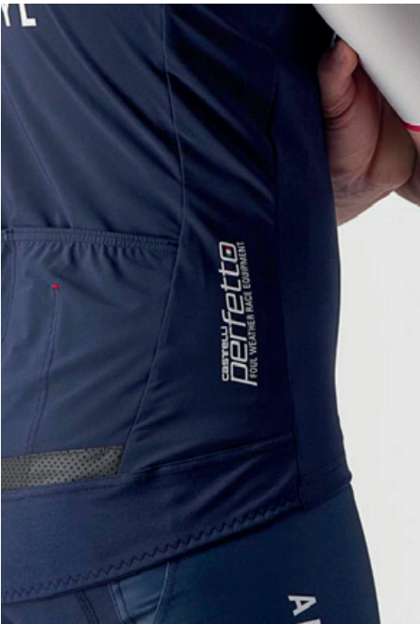
424 BELGIAN BLUE