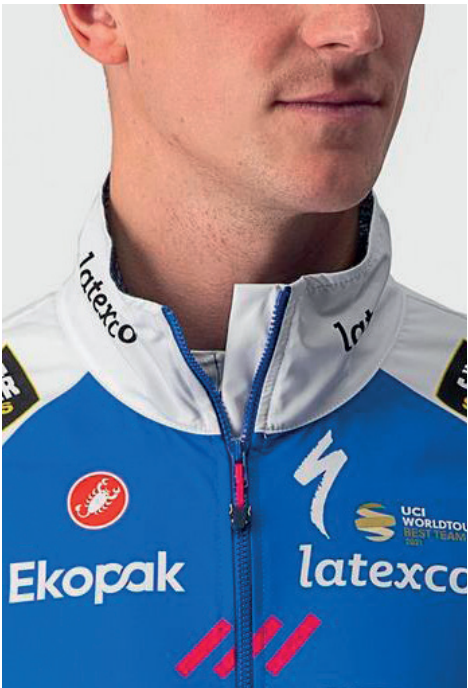
424 BELGIAN BLUE/WHITE