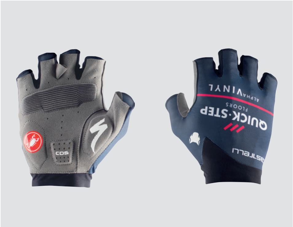
424 BELGIAN BLUE