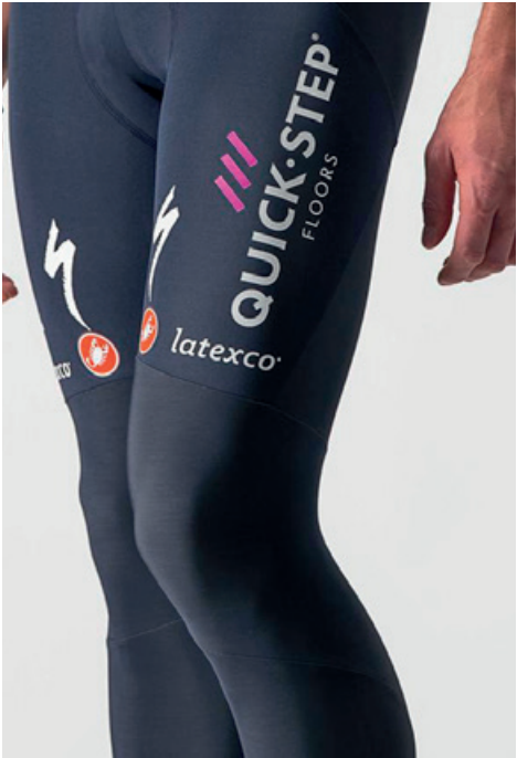
424 BELGIAN BLUE