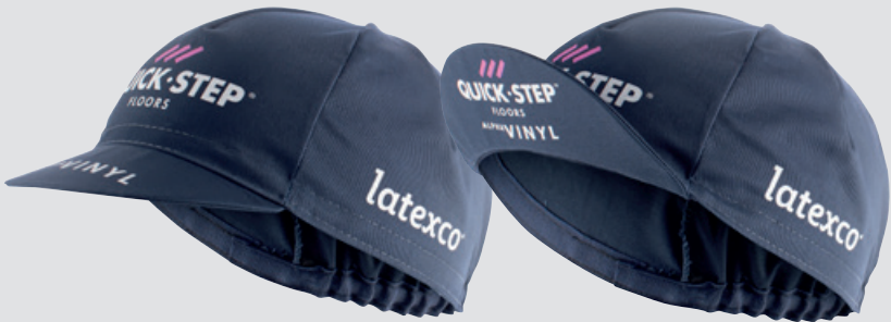
424 BELGIAN BLUE