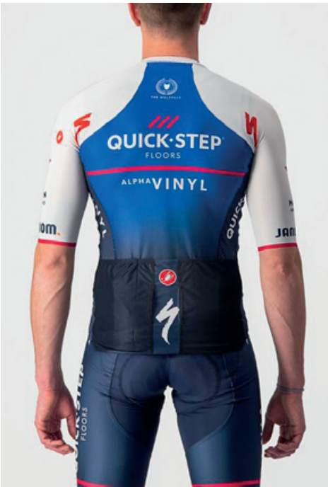
424 BELGIAN BLUE/WHITE