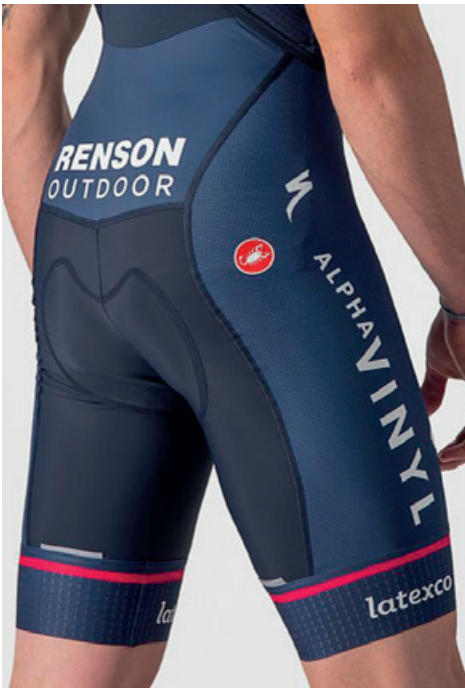
424 BELGIAN BLUE/WHITE