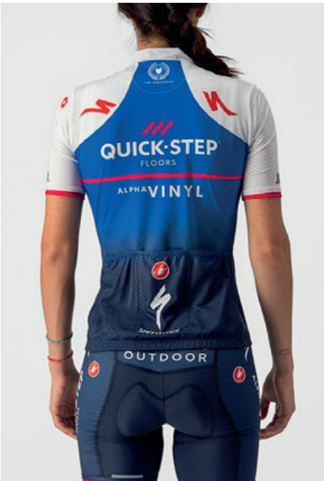
424 BELGIAN BLUE