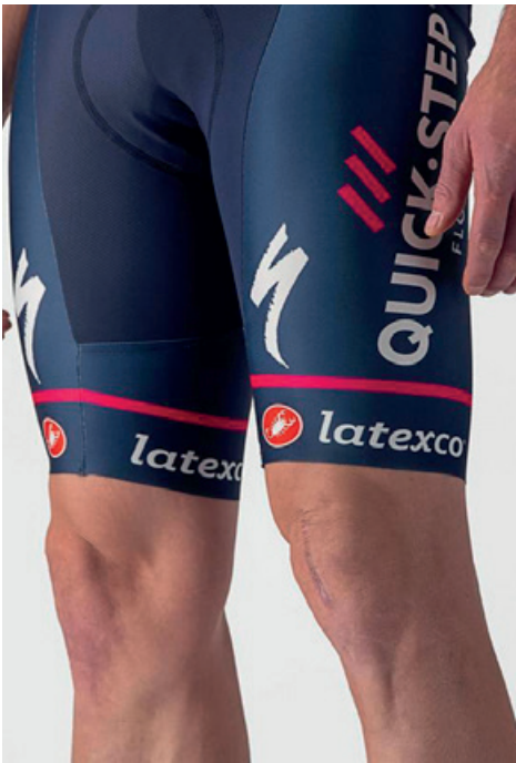
424 BELGIAN BLUE/WHITE